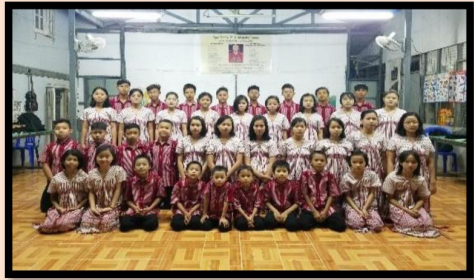
Hpu Mooler Theh Blessing Home Orphanage Care Shelter ဖုမူလာ်သဲဟံၣ်ဘၣ်ဆိၣ်ဂ့ၤတၢ်ကဟုကယၢ်ဖိသၢ်အိၣ်ဆိးလီၢ်