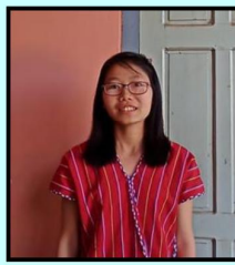
Ma Meh Moe Myit Tar Yeik Mon Orphanage Care Shelter မးမဲးမိၣ် မွဲးတၢ်ယုးမိၣ် တၢ်ကဟုကယၢ်ဖိသၢ်အိၣ်ဆိးလီၢ်