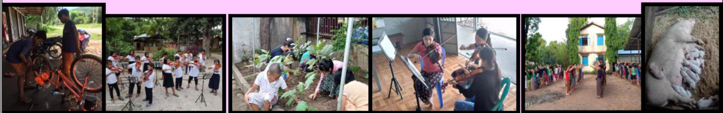
Chit Myitta Orphanage Care Shelter ခွဲးမူးတၢ်ကဟုကယၢ်ဖိသၢ်အိၣ်ဆိးလီၤ

ဒ်သိးဖိၣ်ဃဲဖိသၢ်တဖၣ်ကဒိၣ်ထီၣ်လၢ နီၣ်ခိၣ်နီၣ်သးအဂီၢ်, ကီၢ်ခိၣ်ကီၢ်နီၣ်တဖၣ်, သရၣ်ဒီးသရၣ်မ့ၢ်လၢ အကွၢ်ထွဲဖိသၢ်တဖၣ်ဒီးကမ်းတံၣ်ဖိ တဖၣ်ကျဲးစးဝဲအဂ့ၢ်ကတၢ်န့ၣ်လီၤ. အတၢ်ဟူးတၢ်ဂဲၤတနီၤလၢ တၢ်ကဟုကယၢ်ဖိသၢ်အိၣ်ဆိးလီၤတဖၣ်မၤဝဲမ့ၢ်ဒ်လၢအံၤအသိးန့ၣ်လီၤ.