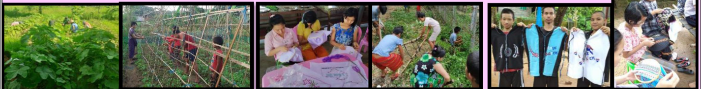
Hpu Sein Htwar Aung Orphanage Care Shelter ဖုစ့ၣ်ထွါအိၣ်တၢ်ကဟုကယၢ်ဖိသၢ်အိၣ်ဆိးလီၤ