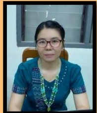
Thramu Ree kho Paw သရၣ်မ့ၢ်ရံခိၣ်ဖိ