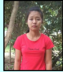
Ma phyu Oo Chit Myitta Orphanage Care Shelter မးဖျါၣ်အူ ခွဲးမွဲးတၢ် တၢ်ကဟုကယၢ်ဖိသၢ်အိၣ်ဆိးလီၢ်