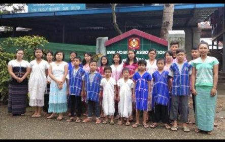
Htee Moo Htaw Ber Orphanage Care Shelter ထံမူထီၣ်ဟံၣ်တၢ်ကဟုကယၢ်ဖိသၢ်အိၣ်ဆိးလီၢ်