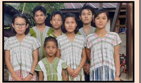
Hpu Sein Htwar Aung Orphanage Care Shelter ဖုစုၣ်ထွဲၤအိၣ်တၢ်ကဟုကယၢ်ဖိသၢ်အိၣ်ဆိးလီၢ်