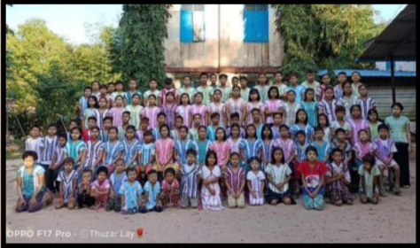
Hpu Saw Bu Orphanage Care Shelter ဖုစီၤဘူးတၢ်ကဟုကယၢ်ဖိသၢ်အိၣ်ဆိးလီၢ်