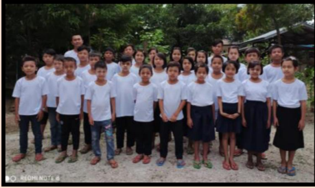
Chit Myitta Orphanage Care Shelter ခွဲးမွဲးတၢ်တၢ်ကဟုကယၢ်ဖိသၢ်အိၣ်ဆိးလီၢ်