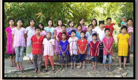
New Eden Orphanage Care Shelter ဇုၤဒုၣ်သီတၢ်ကဟုကယၢ်ဖိသၢ်အိၣ်ဆိးလီၢ်