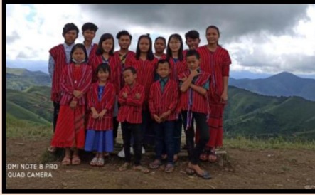
Myit Tar Yeik Mon Orphanage Care Shelter မွဲးတၢ်ယုးမိၣ်တၢ်ကဟုကယၢ်ဖိသၢ်အိၣ်ဆိးလီၢ်