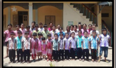
Paradise Orphanage Care Shelter ဟၤရၤဒံးစူးတၢ်ကဟုကယၢ်ဖိသၢ်အိၣ်ဆိးလီၢ်