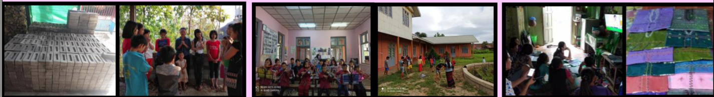
Htee Moo Htwar Ber Orphanage Care Shelter ထံမူထီၣ်ဟီၢ်တၢ်ကဟုကယၢ်ဖိသၢ်အိၣ်ဆိးလီၤ