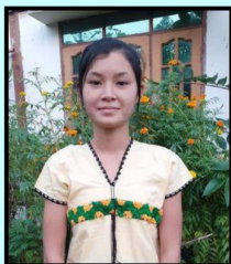
Naw Eh Paw Hpu Sein Htwar Aung Orphanage Care Shelter နီၢ်အိၣ်ဖိ ဖုစုၣ်ထွဲၤအိၣ်တၢ်ကဟုကယၢ်ဖိသၢ်အိၣ်ဆိးလီၢ်